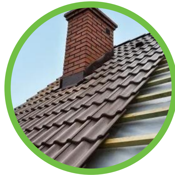
Roof or thatch replacements