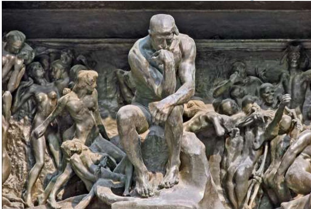
The Thinker at the “Gates of Hell”