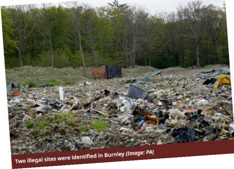
Two illegal sites were identified in Burnley

20,000 Tonnes of waste discovered in field beside A34, Kindlington, Oxfordshire!