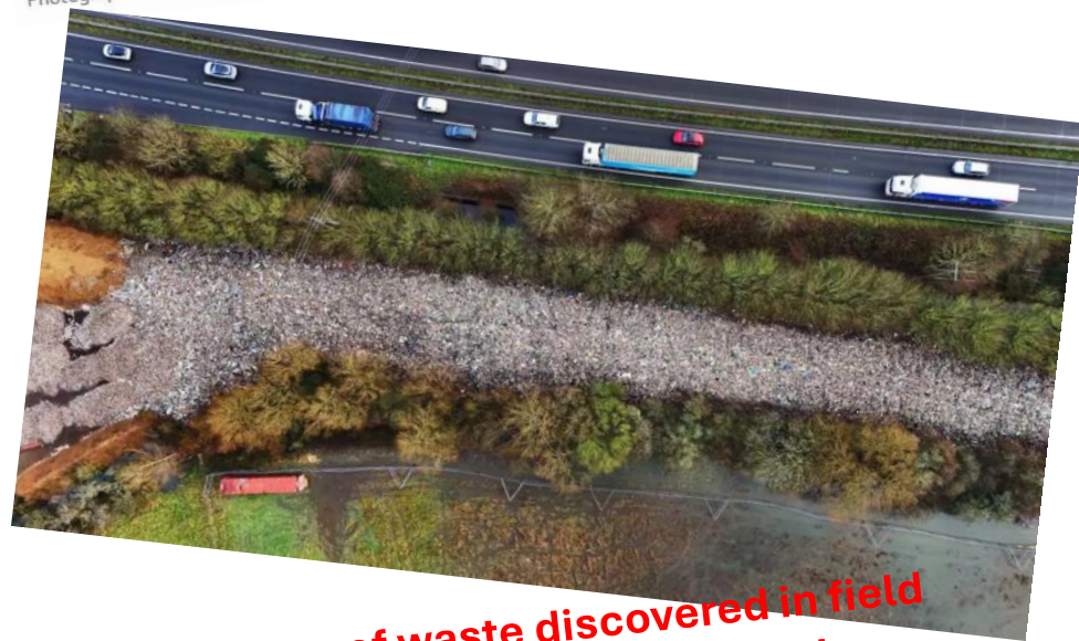
20,000 Tonnes of waste discovered in field beside A34, Kindlington, Oxfordshire!