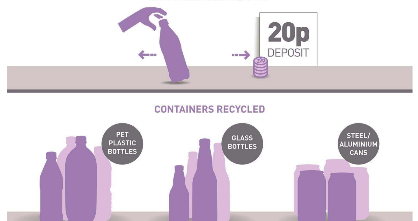
BUY DRINK. PAY DEPOSIT