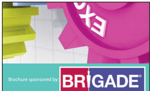
Examples of previous conference brochure sponsors