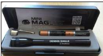
MAGlite torch sponsored by Dennis Eagle