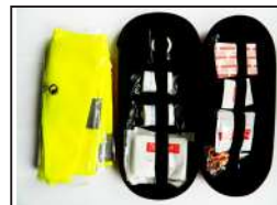
Car first aid kit sponsored by DAF