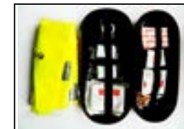
Car first aid kit sponsored by DAF