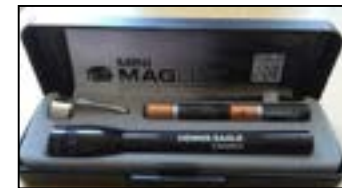
MAGlite torch sponsored by Dennis Eagle