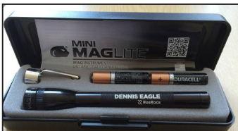
MAGlite torch sponsored by Dennis Eagle