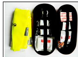
Car first aid kit sponsored by DAF