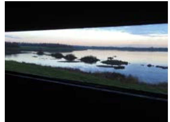
Anglers Country Park