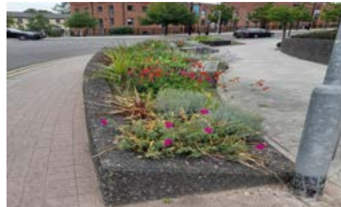
Changing approach to city centre planting