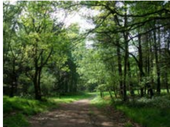
Haw Park Wood