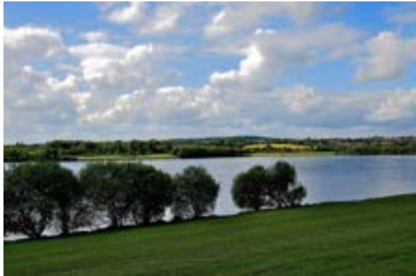
Pugneys Country Park