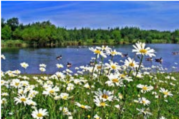
Walton colliery nature park

Reclaimed colliery sites transformed into nature reserves