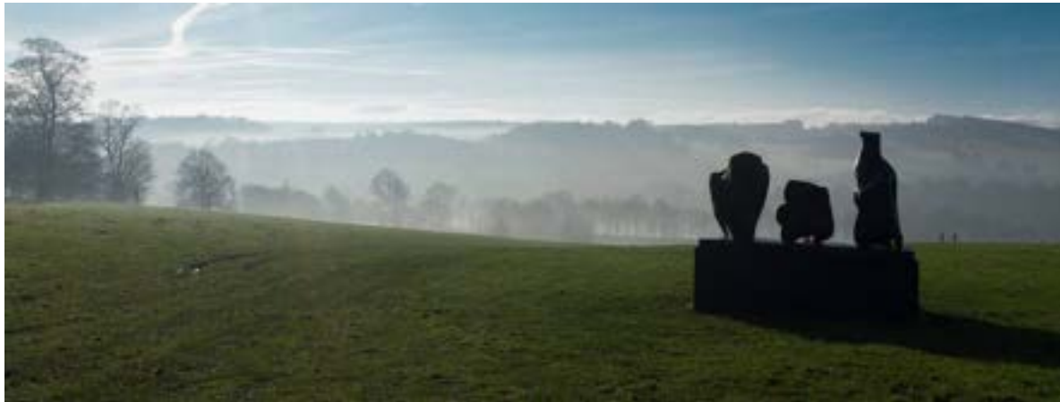
Yorkshire Sculpture Park

High profile green spaces – The Yorkshire Sculpture Park, Nostell Priory (NT), Fairburn Ings (RSPB), National Coal Mining Museum, Hepworth Gallery Garden