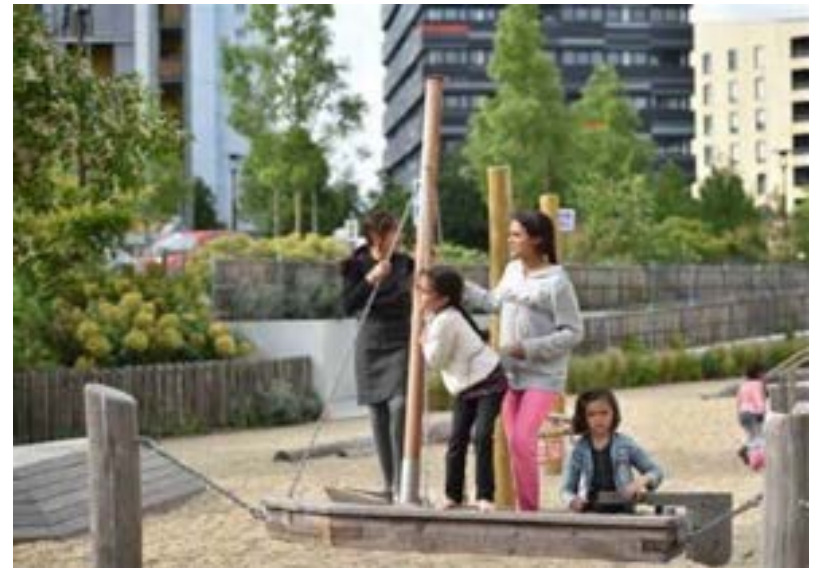
Pounds Park, Sheffield City Centre, 2023