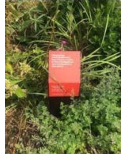
Detail from Sheffield Grey to Green – public art (left) and public information (above)