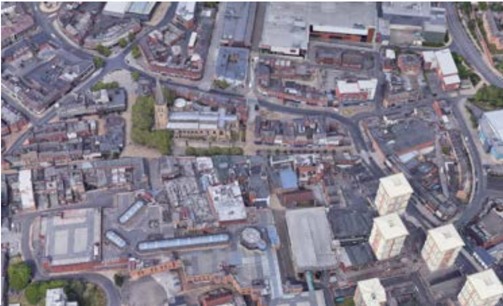
Aerial view of Wakefield city – still so little green!