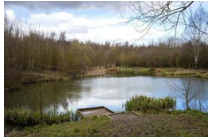
Lofthouse colliery nature park