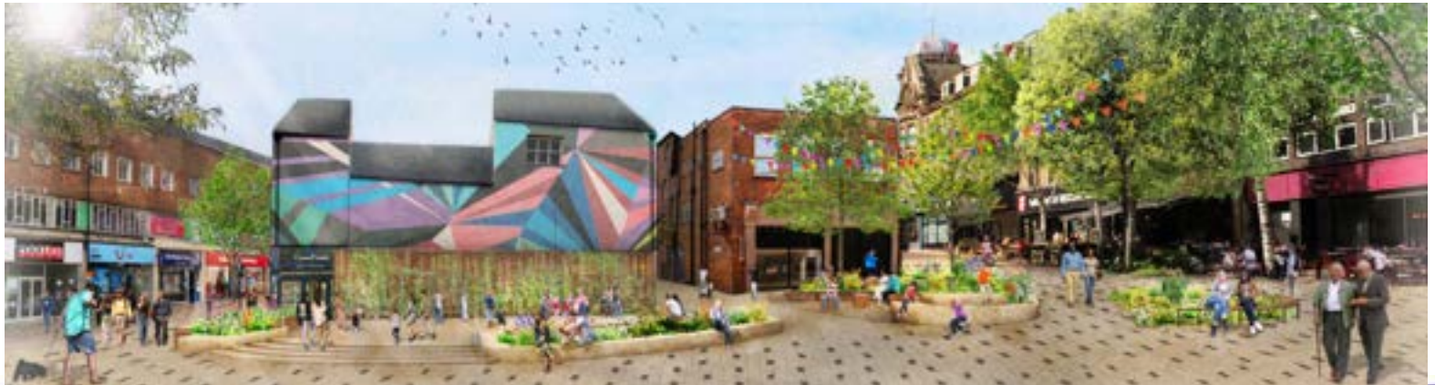
Visualisations of Cathedral Square