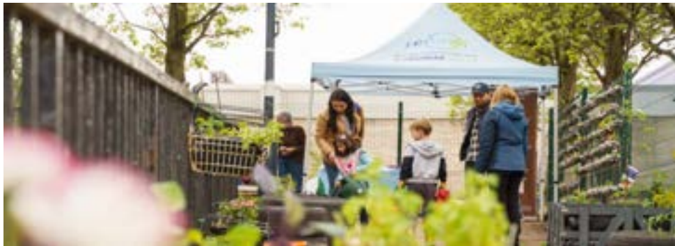
Earth Day, PembertonHouse Community Garden, Wakefield April 2023