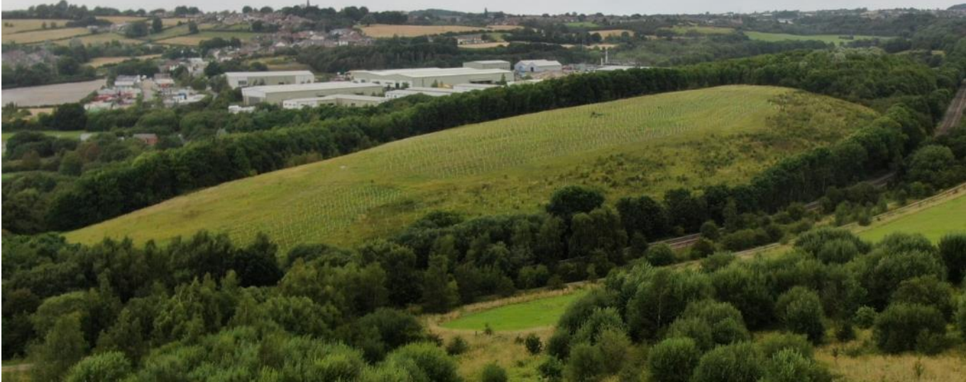
Year 1 scheme – Bentinck (Green Spaces site)