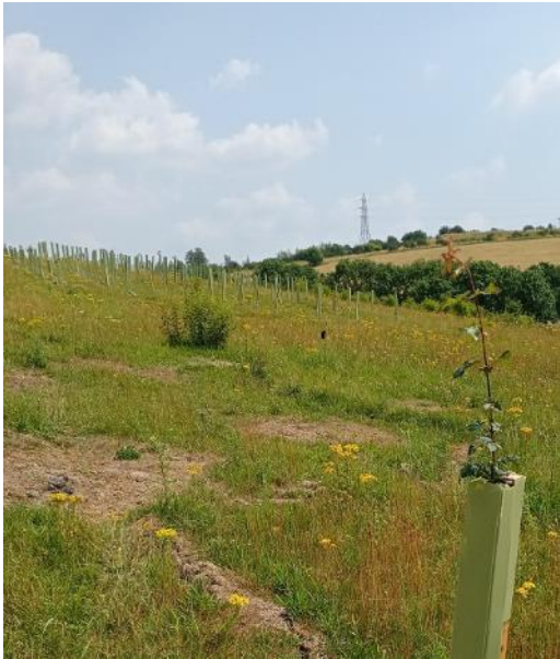
Establishment of a new 4.9ha woodland. Over 4400 trees planted.