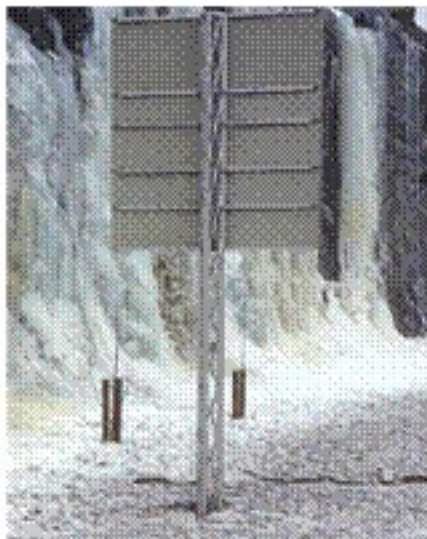
The First Lattix Sign assembly